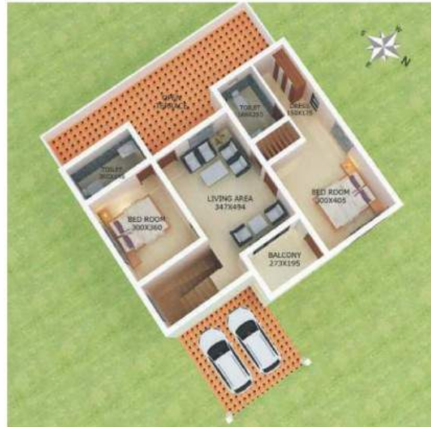
FIRST FLOOR 896 Sq. Ft