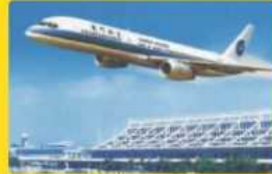
AIRPORT - 15 KM