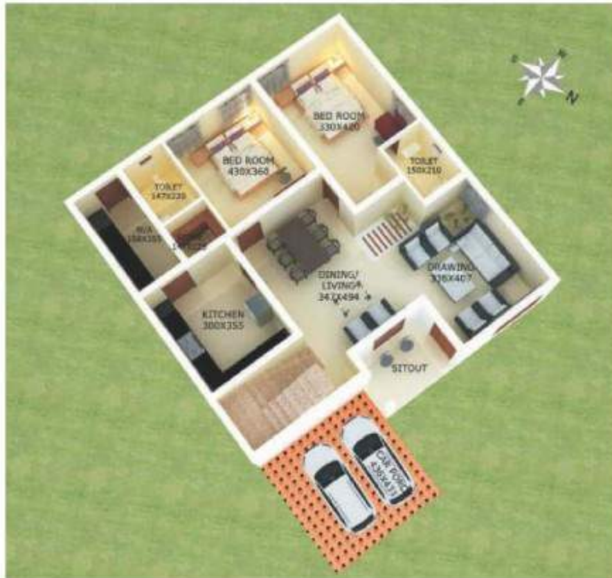
GROUND FLOOR 1478 Sq. Ft

Daffodils LUXURY VILLAS & APARTMENTS @ THIRUVANMIYAPURAM