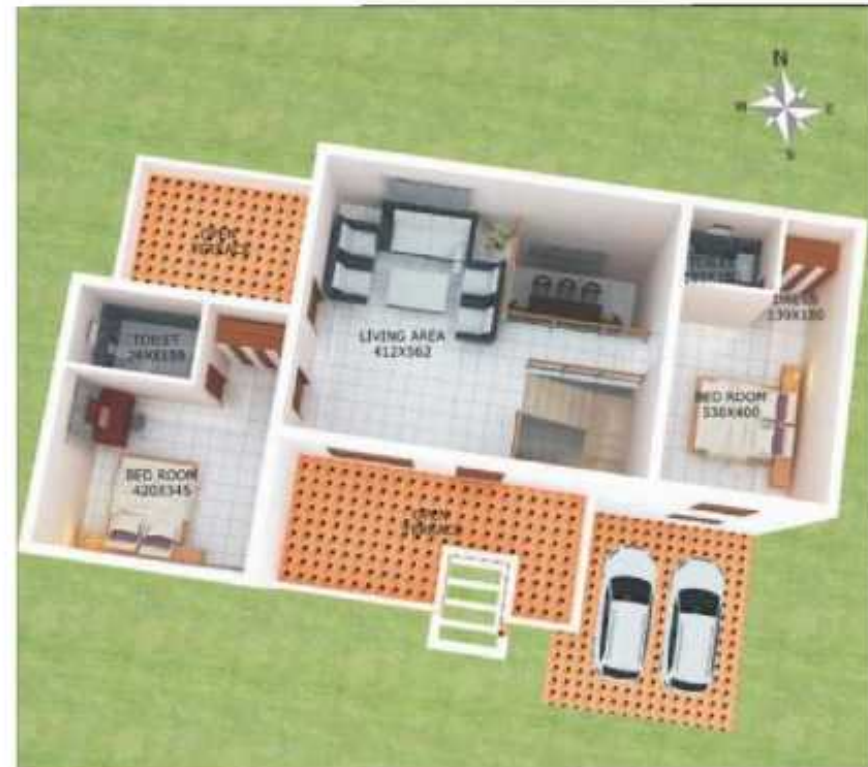
FIRST FLOOR 958.1 Sq. Ft.