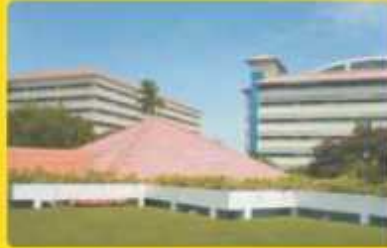
TECHNOPARK - 11 KM

Located near Mar Ivanios College, Vattappars and just 2 km from MC Road, 5 km from St. Thomas School and 11 km from Technopark, well connected with Highways, Railway and Airport, close proximity to many prestigious Educational Institutions, Hospitals and Shopping Areas makes KBD Daffodils a premium home for you and your family.