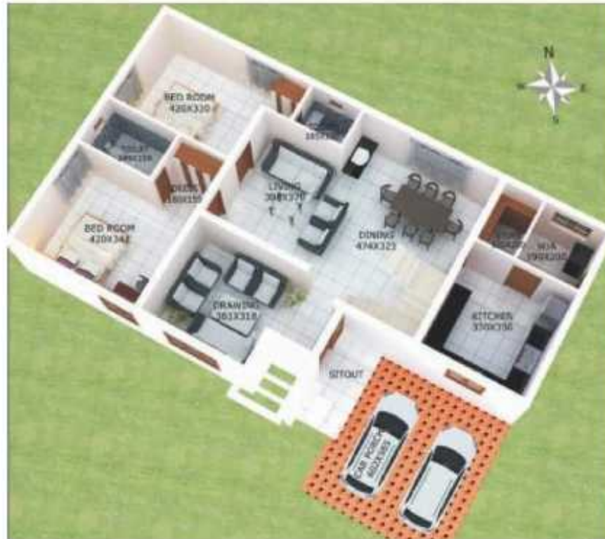
GROUND FLOOR 1789.54 Sq. Ft

Daffodils LUXURY VILLAS & APARTMENTS @ TRIBUNANANTHAPURAM