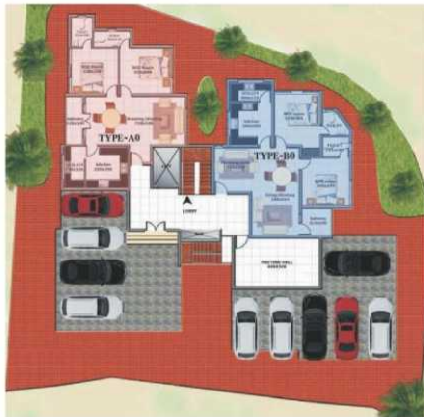
APARTMENTS | GROUND FLOOR