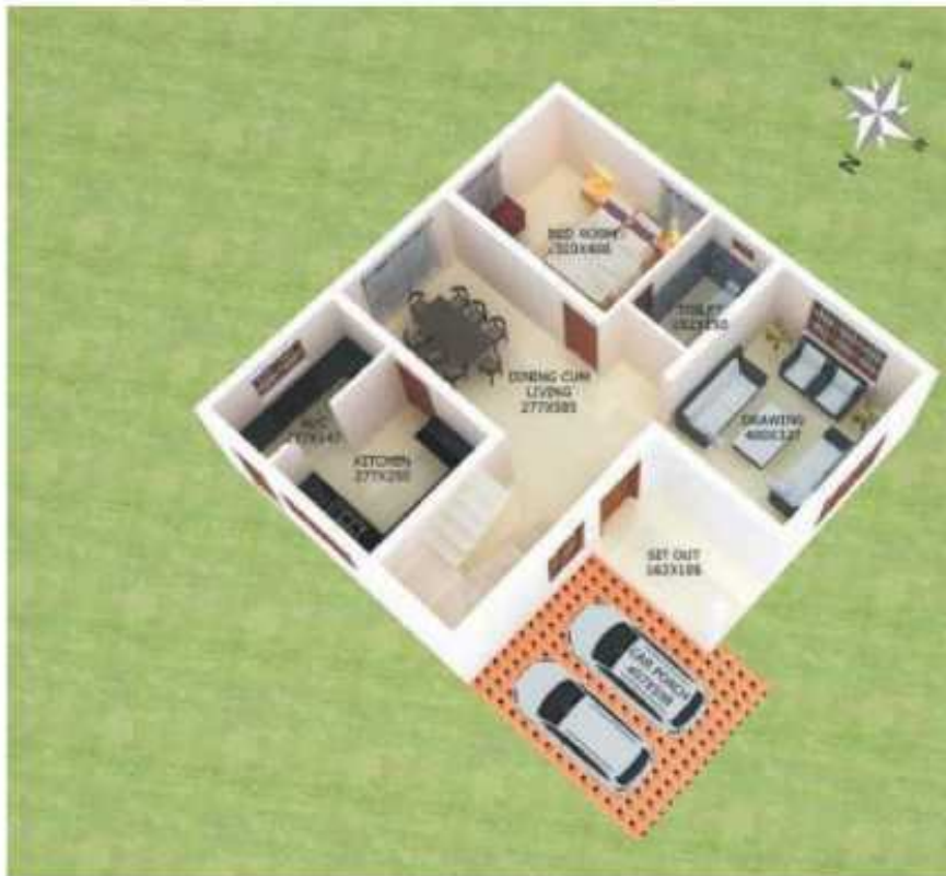
GROUND FLOOR 1203 Sq. Ft.

Daffodils LUXURY VILLAS & APARTMENTS @ THELVANANTHAPURAM