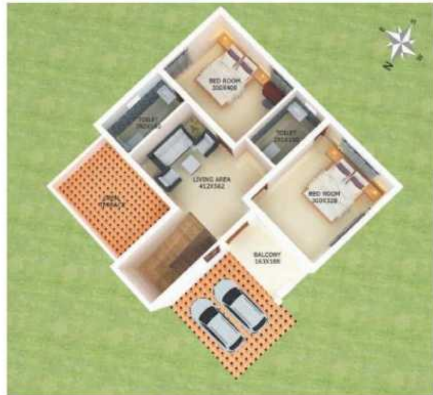
FIRST FLOOR 800 Sq. Ft.