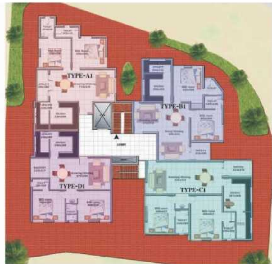
APARTMENTS | FIRST TO THIRD FLOOR