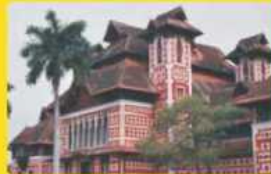
MUSEUM - 13 KM