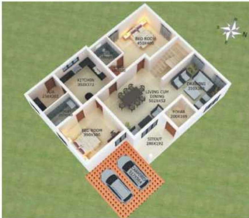
GROUND FLOOR 1744.62 Sq. Ft

Daffodils LUXURY VILLAS & APARTMENTS @ THELVANANTHAKURAM