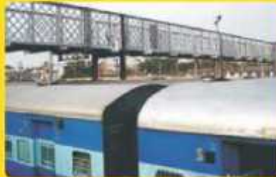
RAILWAY STATION - 14 KM