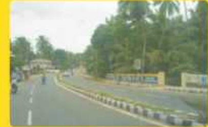
FROM MC ROAD - 2 KM