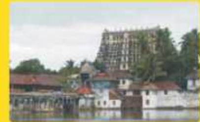
PADMANABHA SWAMI TEMPLE - 15 KM