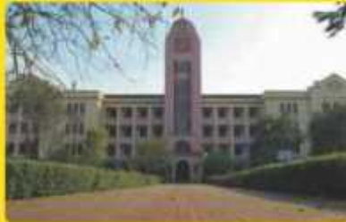
MAR IVANIOS COLLEGE - 7 KM